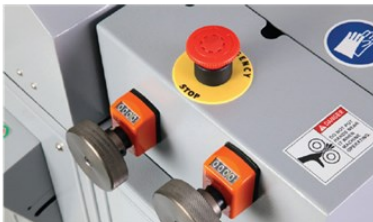
Coating roller gap dials for one-time adjustments