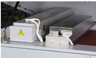
Long conveyor with UV lamp and optional infra-red unit

• Infrared heating system (optional) helps cure difficult stock or specific digital presses toners with a glossy and smooth finish and delivers consistent quality.